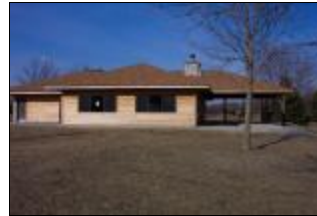
Bob Heun Shelter House

A heated and air conditioned shelter house that can be rented for reunions, graduations, company picnics, etc.