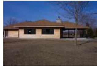
Bob Heun Shelter House

A heated and air conditioned shelter house that can be rented for reunions, graduations, company picnics, etc.