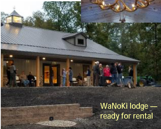
WaNoKi lodge — ready for rental