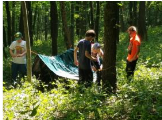
Youth conservation camp — Outdoor skills and Exploration