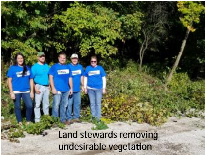
Land stewards removing undesirable vegetation

— Stewardship workers — — Outdoor enthusiasts — — Youth campers —